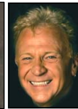
Normie Rowe AM